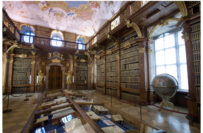
Melk Abbey library

Napoleon used Melk Abbey as his headquarters when campaigning in Austria and the monastery also survived WWII, only to be badly damaged by fire once again in 1947. Today it is surrounded by landscaped gardens with spectacular views over the Wachau Valley and the Danube.